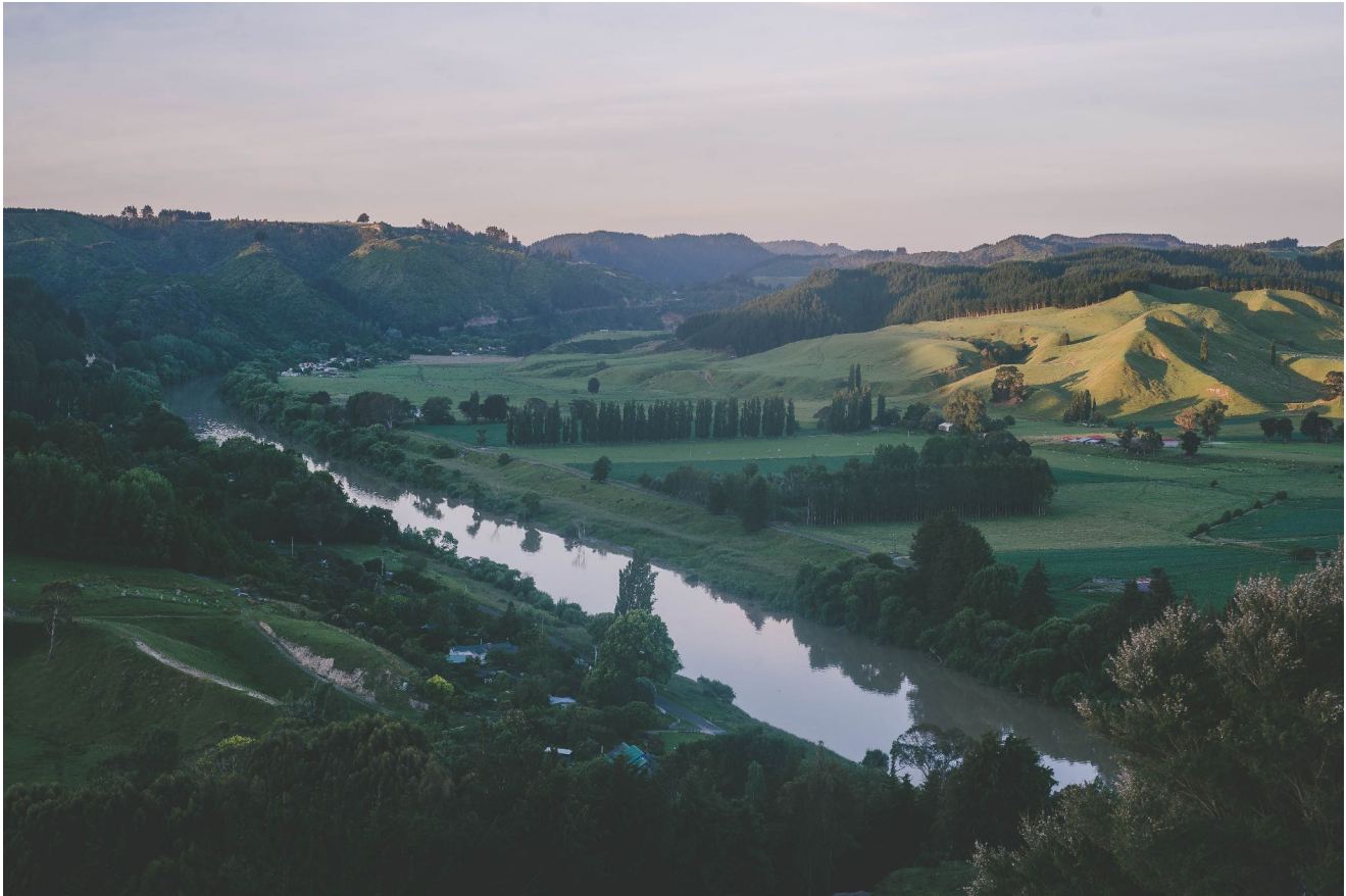
View from The Learning Environment hill site. In 2017, the Whanganui River became the first river in the world to be designated rights of legal personhood.

That's why this philanthropic intervention is so important: it will enable the land title transfer into a charitable trust, and catalyze this group of people and location to be of significant long-term benefit to the community and country, while setting it up for a sustainable financial trajectory. This funding will also fill the crucial early-stage gap that existing government and foundation grants are failing to meet, because land acquisition does not qualify for most programmes.