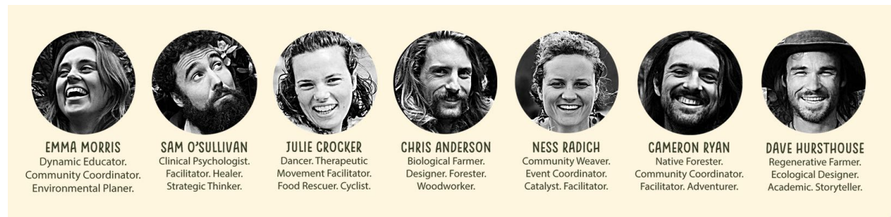
The Learning Environment coordination team.

Though starting from a low capital base, the crew has an abundance of social capital, with many friends and allies around the country to call on for help with construction, facilitating, cooking, mentoring, guest teaching, and more. This grassroots network of goodwill is a testament to the team's contagious enthusiasm and positive energy, which will undoubtedly reflect in their educational experiences as well.